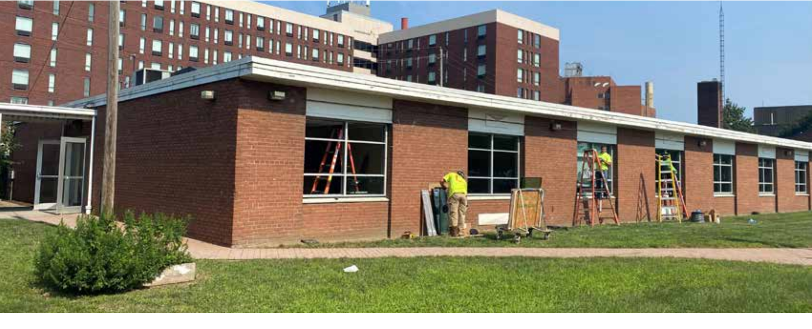
Crews work to install new windows for Mary's Home, replacing the windows that were original to the building.