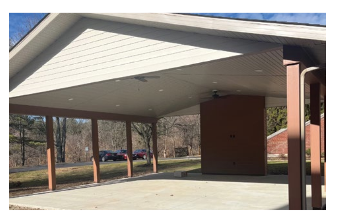
Construction of pavilion complete in 2022. The landscape, fencing, brick pavers, benches and walkways will be completed in 2023.