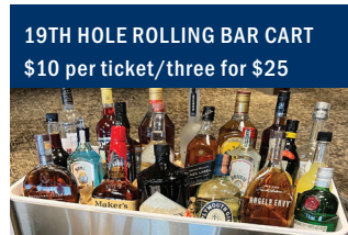
19TH HOLE ROLLING BAR CART $10 per ticket/three for $25