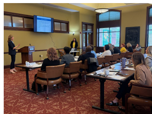
Attendees at the annual grant application workshop

On April 28, the Foundation hosted its annual grant application workshop, welcoming more than 20 attendees representing 19 organizations. The event is designed for nonprofits interested in applying for funding. During the session, participants learned about the Foundation’s grantmaking priorities, application guidelines and overall process. They also had the chance to connect with Foundation staff and get their questions answered.