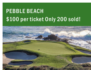
PEBBLE BEACH $100 per ticket Only 200 sold!