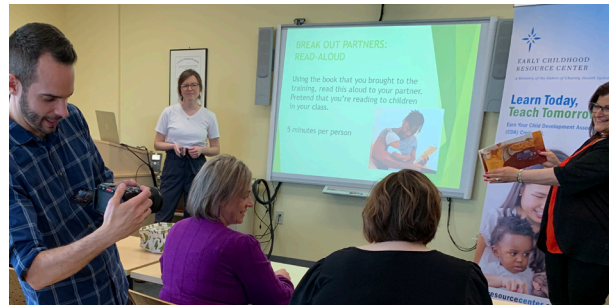
Capturing additional footage for the video