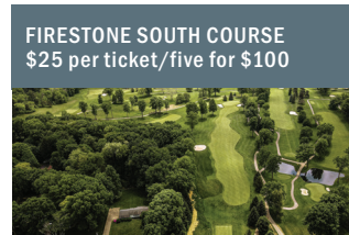
FIRESTONE SOUTH COURSE $25 per ticket/five for $100