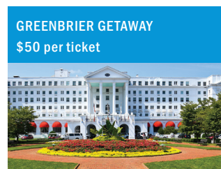
GREENBRIER GETAWAY $50 per ticket