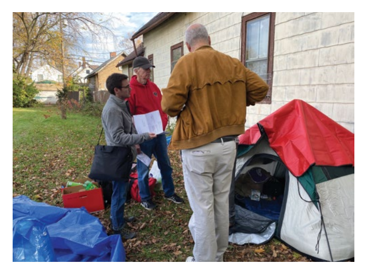
The NEOCH Street Outreach team reviews a letter for a client who can't read and discusses the date of a court hearing to apply for disability income, while also helping the client schedule follow-up medical appointments.

"There are many reasons people are unsheltered. They might not feel safe in a shelter or a couple doesn't want to be separated. We meet people where they are and where they feel safe to first help them meet their basic needs while also offering immediate shelter. If that's not for them, we work to build relationships over time and connect them to medical and behavioral health care and other services along the way with the goal of eventually connecting them to housing."