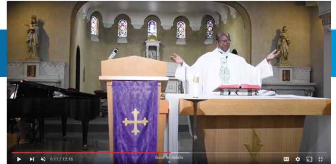
The Feast of St. Joseph Mass was a hybrid event this year, with a small in-person gathering and a Zoom event for those not in attendance.