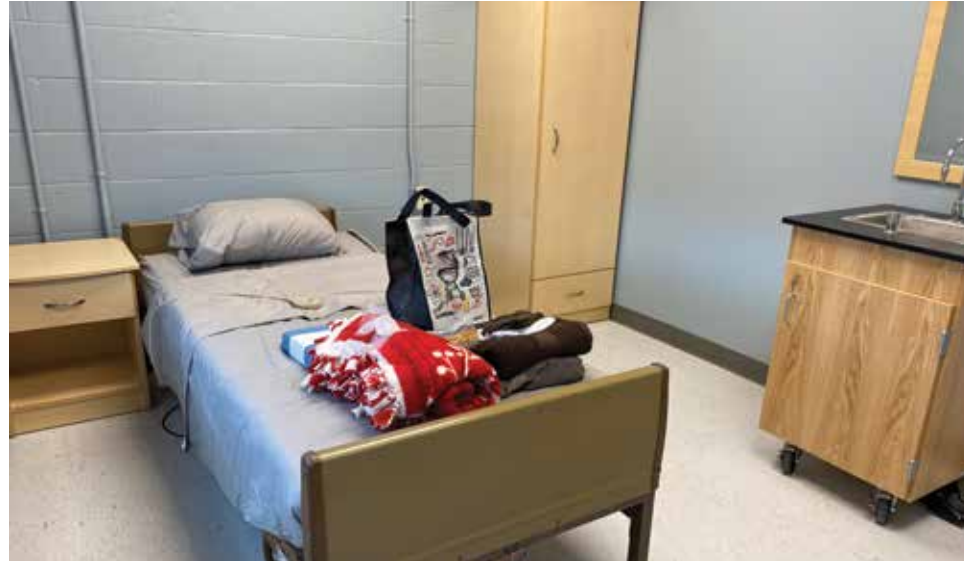
A furnished room in Mary's Home