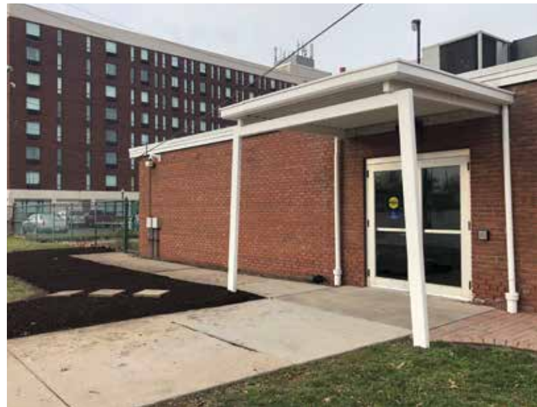
Mary's Home front entrance

With the first resident welcomed in late March, Mary's Home is now providing a nurturing, caring place to recuperate for women experiencing both homelessness and acute medical conditions. Mary's Home joins Joseph's Home as the only local organization offering care for people experiencing homelessness who are too ill or frail to recover from an illness or injury on the streets or in a traditional shelter.