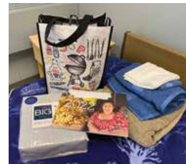
Each new resident receives a welcome kit with sheets, towels and other essentials