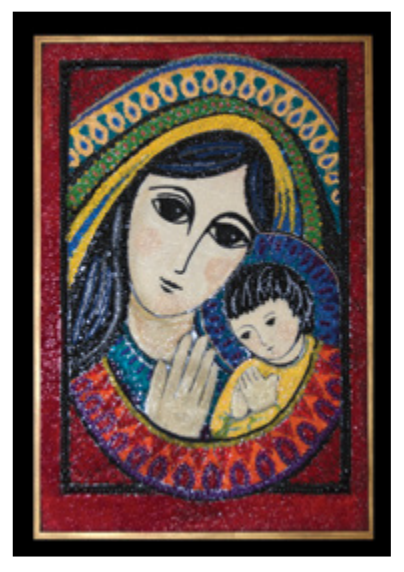
Award-winning art by an RHC resident