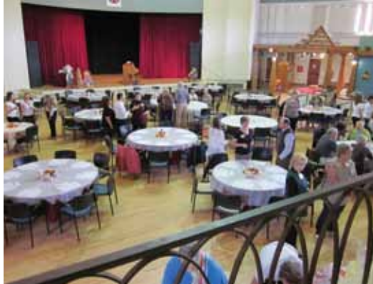
Volunteers & Staff make the final touches before nearly 500 people converged on LOHV for a very successful Fall Fest.

Autumn's beauty shone bright on October 14 as the 23rd Annual Fall Fest took place. Some 90 committee, volunteers and staff members were there for this special event that resembles a grand family reunion where there is something for everyone! The number does not include the many others who sponsored the event, baked, donated baskets, bought raffle tickets, assisted in the preparations and prepared the well-commended meal. The Fall Fest netted over $40,000 for the Benevolent Fund of LOHV.