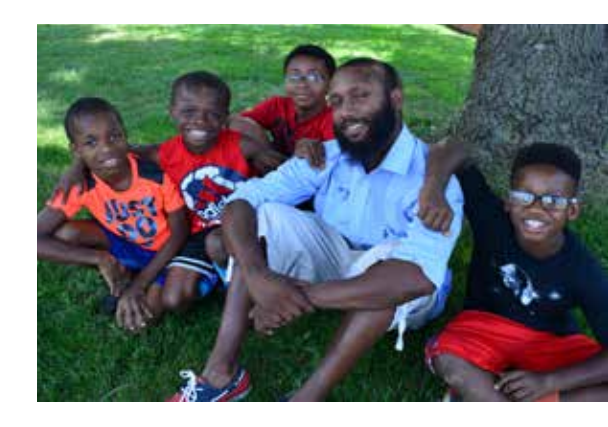
"I realize the better I raise them, the better they will raise their children."

As he says it, "I realize the better I raise them, the better they will raise their children."