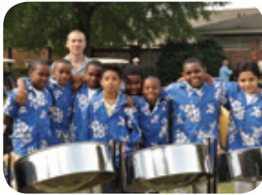
The Conder Elementary School All Star Steel Band provided entertainment at the golf tournament.