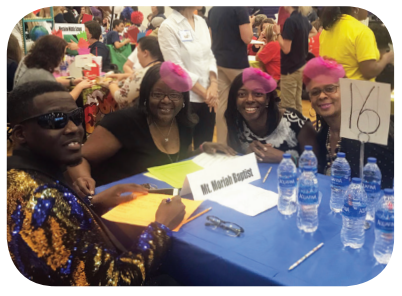
Pictured is one of 61 teams who competed in the spelling bee

MISSION: In the spirit of the Sisters of Charity of St. Augustine, Healthy Learners is devoted to removing children's health barriers to learning with love and compassion.