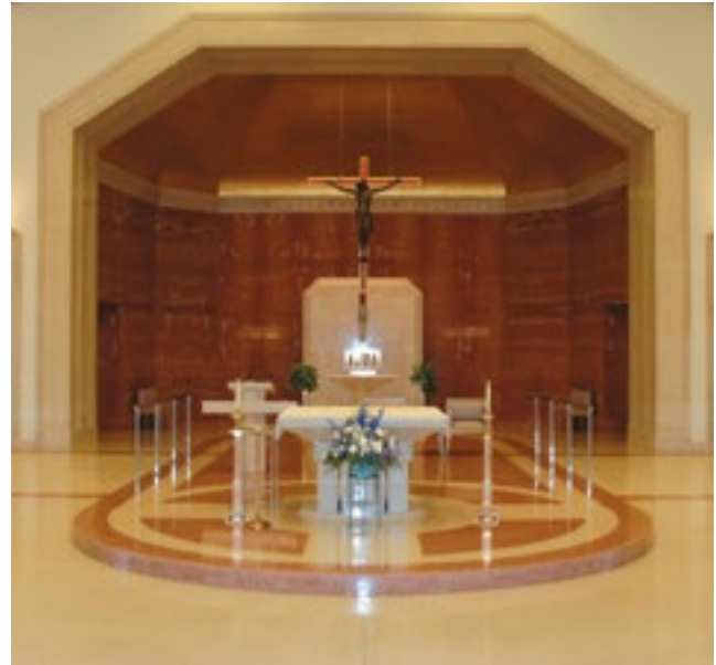
Chapel at Mt. Augustine

In the 1980s personal, psychological and physical pre-retirement and retirement planning; a financial needs analysis; studies on the use of CSA properties within the Community; and inter-congregational discussions at the diocesan level all contributed to the decision to redirect the purpose of Mt. Augustine. When the 140th anniversary of the Community was celebrated, construction began for Regina Health Center, a $7.5 million innovative health care and assisted living facility for priests and lay persons who wished to live in a God-centered environment. The renovation of a portion of the existing Motherhouse building and others provided an 81-bed skilled and intermediate care nursing unit and a 73-bed assisted living unit that opened in 1983 with a full range of geriatric services for retired female and male religious. Additional nursing beds and other services have been added more recently. A unique aspect of this project is the collaboration with other religious communities and diocesan officials in the assessment