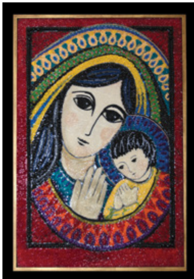
Award-winning art by an RHC resident