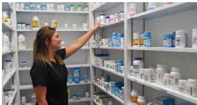
Joseph's Home and The Centers for Families and Children have partnered to streamline how prescriptions are filled for residents and alumni. Pictured is a pharmacist at The Centers.