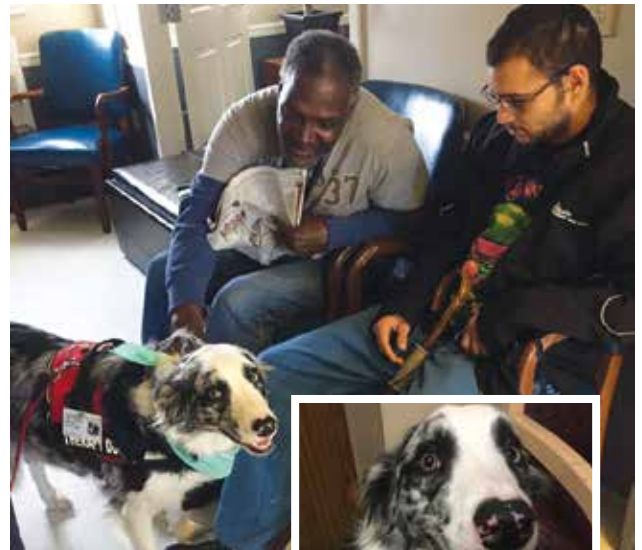
Residents have enjoyed weekly visits with Cooper, a pet therapy dog.