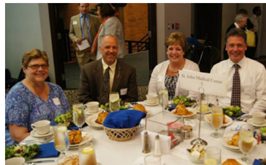
Guests from St. John Medical Center