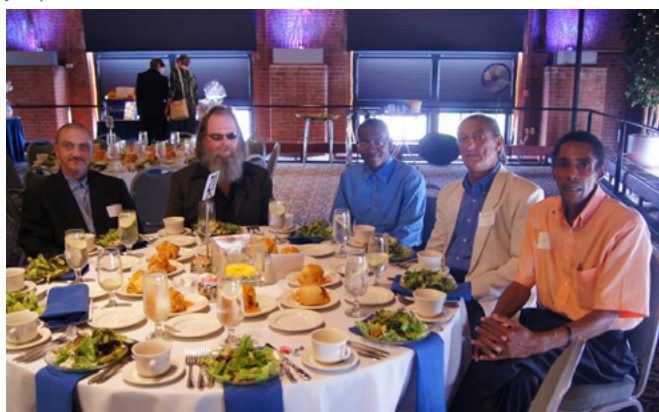
Joseph's Home residents

For more pictures and information about Perseverance in Hope 2014 , visit josephshome.com/events.html . Stay tuned for more information about Perseverance in Hope 2015!