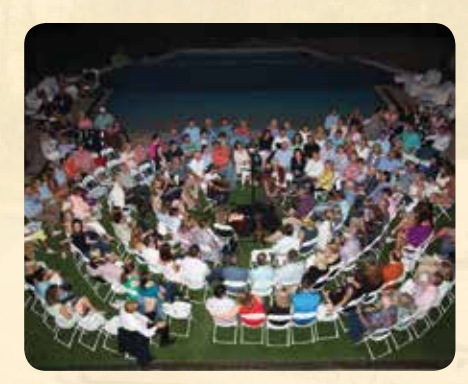
Songwriters in the Round's intimate setting.