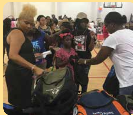
Georgetown County families and students received free backpacks, school supplies and health screenings.