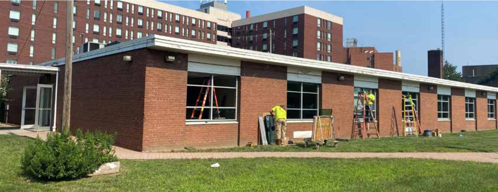
Crews work to install new windows for Mary's Home, replacing the windows that were original to the building.