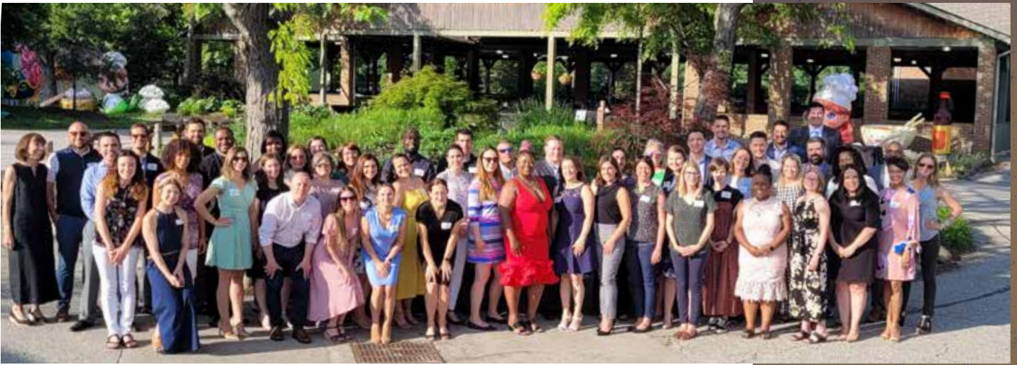
Cleveland Bridge Builders Class of 2021