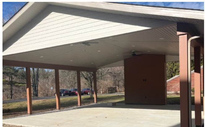
Construction of pavilion complete in 2022. The landscape, fencing, brick pavers, benches and walkways will be completed in 2023.