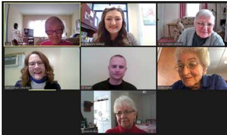
Members of the Dream Team joined Joseph's Home staff for a virtual discussion about the establishment of Joseph's Home and their hopes for the future of the ministry.