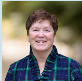
Hiller Davenport Foundation Coordinator