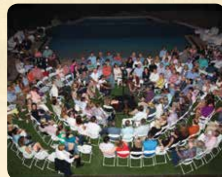
Songwriters in the Round's intimate setting.