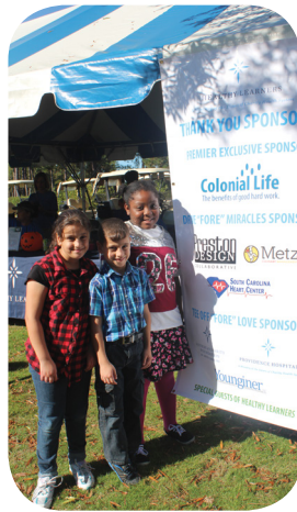
Healthy Learners students