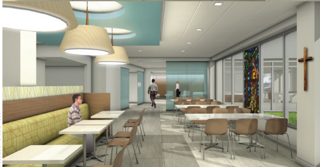
Illustration credit: Vocon