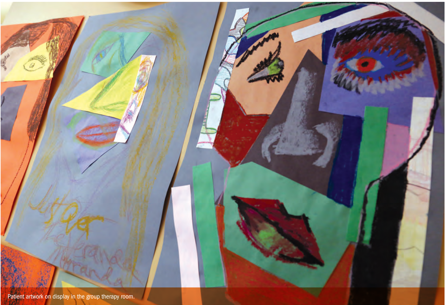
Patient artwork on display in the group therapy room.

In a typical day Heather will hold numerous art therapy sessions in different areas of the hospital. She works closely with St. Vincent Charity's behavioral health inpatients in geropsychiatry, Rosary Hall's addiction detoxification unit, the adult acute stabilization unit and the adult psychiatric unit. An art therapy session will usually last around an hour and in that time patients are able to create one piece of artwork, but they also leave with a lot more than that. Talk therapy is very much a part of each session she holds.