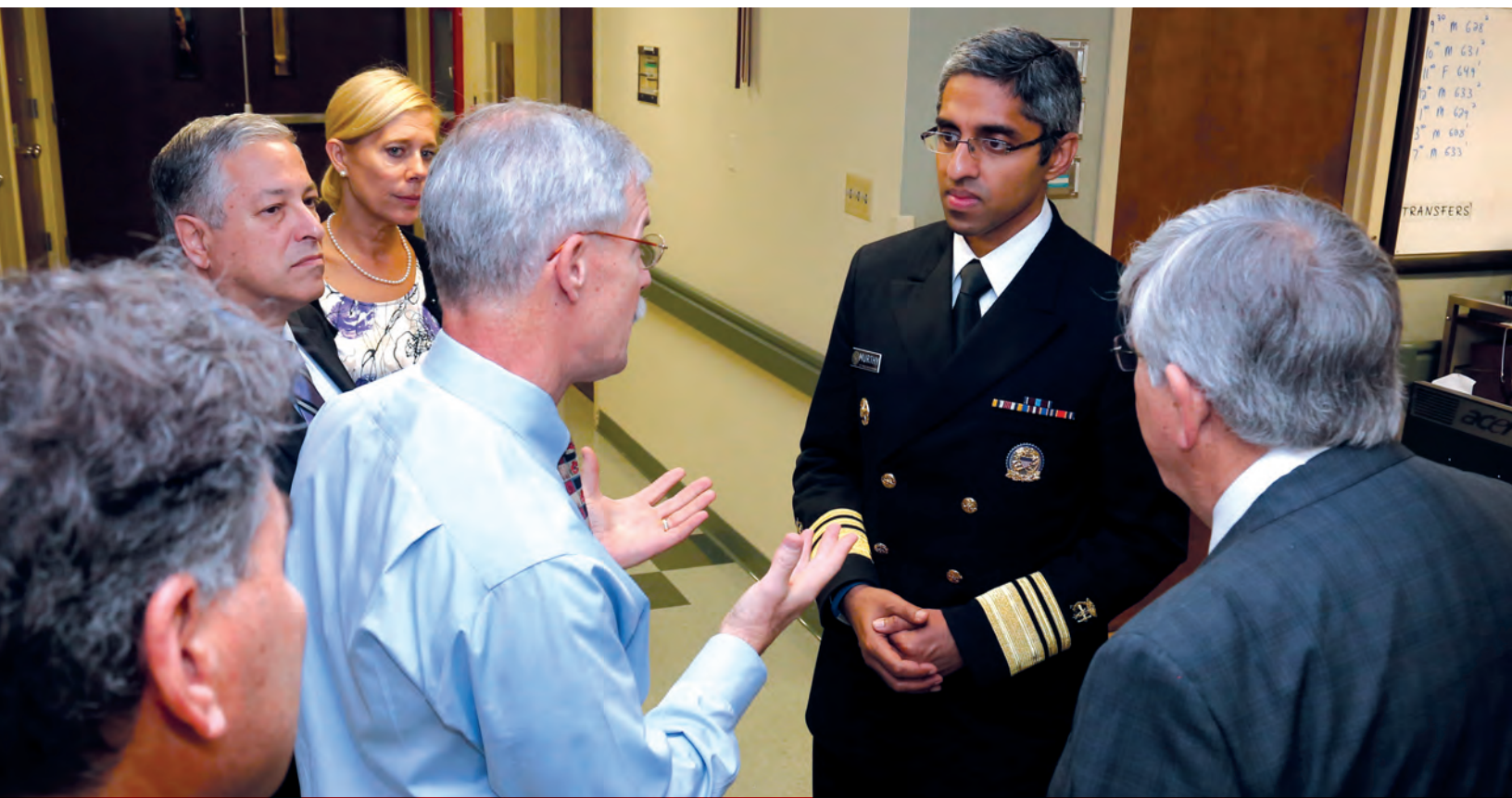
St. Vincent Charity's addiction specialists discuss the challenges of the opiate crisis in Northeast Ohio with Dr. Murthy during his recent visit to Rosary Hall.