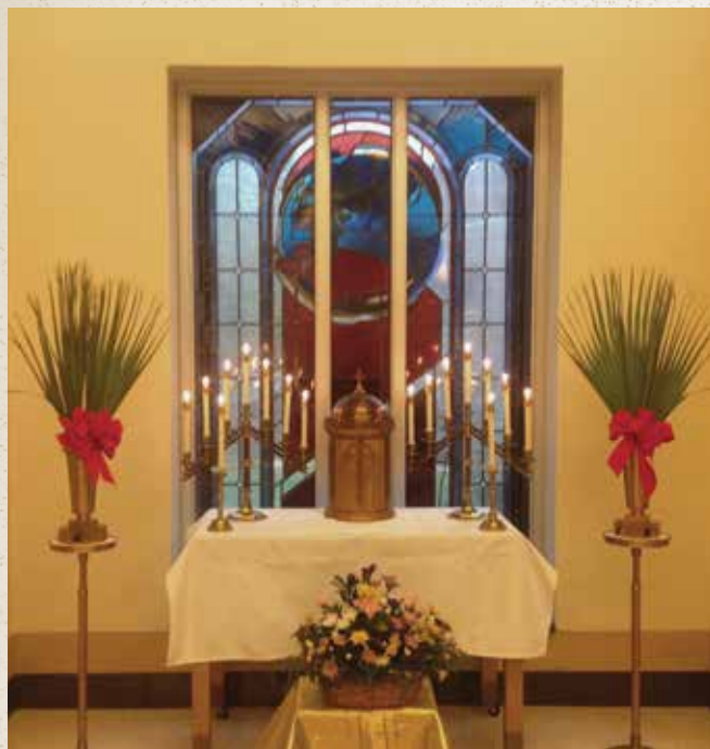
Holy Thursday culminates in the Mass of the Lord's Supper followed by a silent vigil before the tabernacle.

Each year, the Christian faithful are gifted with the sacred season of Lent. During these 40 days, we are encouraged to listen more intently to the word of God and to devote ourselves to prayer and good works. In this way, in a genuine spirit of repentance, we prepare ourselves to renew the promises of our baptism and enter fully into the joy of Easter.