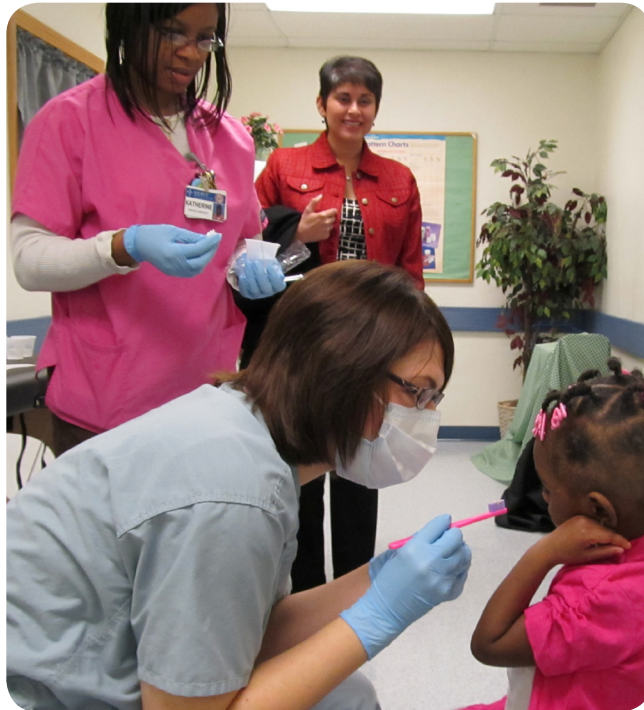
Screening day at the YWCA of Canton.